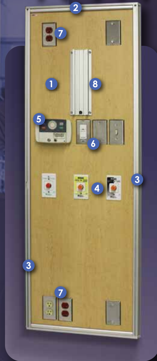
Appearance of Installed Unit

INTERSPEC UNITY RM Series recess-mounted vertical headwall systems are custom-manufactured to fulfill the customer's specifications and objectives as laid out in the detailed shop drawings and documents prepared during our consultations in the preliminary design stage.