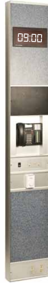
18" CONTROL PANEL