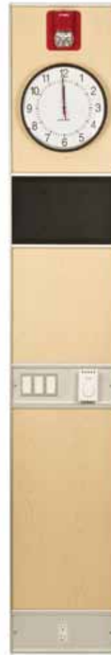
16" CONTROL PANEL