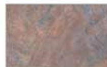
Formica 7226 Crayon