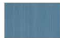
Arborite P310 Tatami Denimu