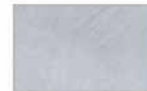
Formica 7740 Buffed Aluminum