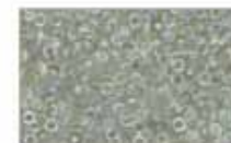
Formica 2967 Beluga