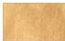
Formica 7481 Natural Birch