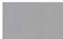
Arborite P623 Brushed Aluminum