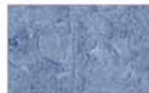
Formica 7268 Denim Canvas