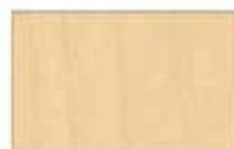
Formica 86992 Hard Rock Maple