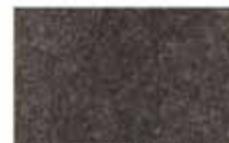
Formica 3450 MineralJet